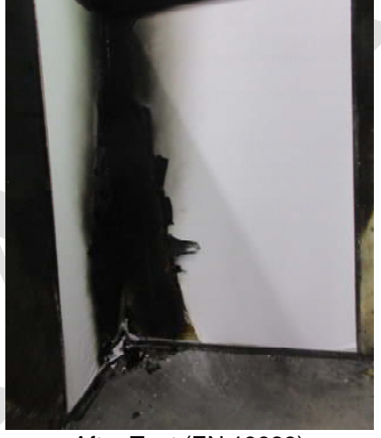
Before Test (EN 13823) After Test (EN 13823) ********* End of report*******